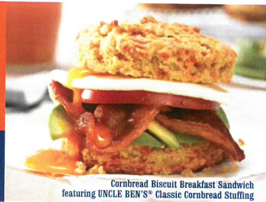
Cornbread Biscuit Breakfast Sandwich featuring UNCLE BEN'S® Classic Cornbread Stuffing

Eligible products purchased October 1, 2020–December 31, 2020 Postmarked by: January 31, 2021