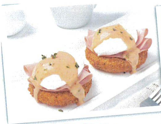
Mrs. Friday's® Oven Ready Parmesan Crusted Krabbycakes®