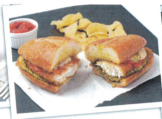
Mrs. Friday's® Oven Ready Parmesan Crusted Pollock